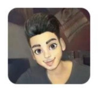
Dzul ( Community Super Connector )