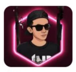
Ak-Ray (Cat Army Commander)