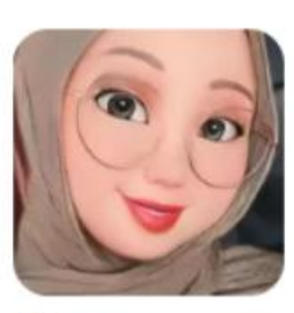
Lilnana ( Moderator )